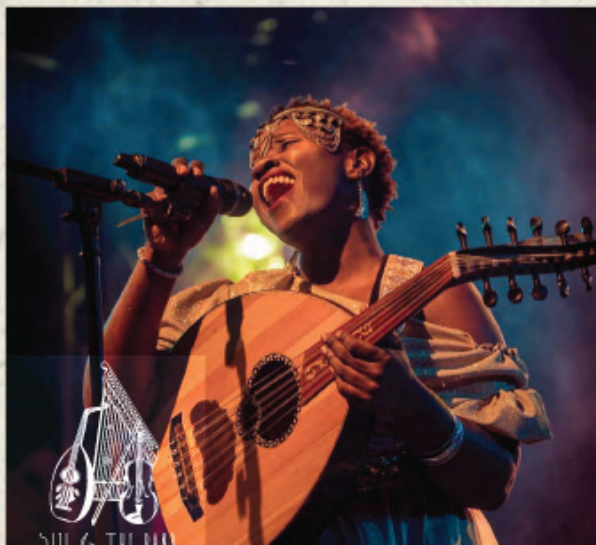
SITI & THE BAND

INTRODUCING THE FIRST INTERNATIONAL BAND TO PERFORM AT CAPITAL NIGHTS "SITI AND THE BAND" AND SUDAN'S FINEST HIP HOP SENSATION "YOUNG JUSTUS"